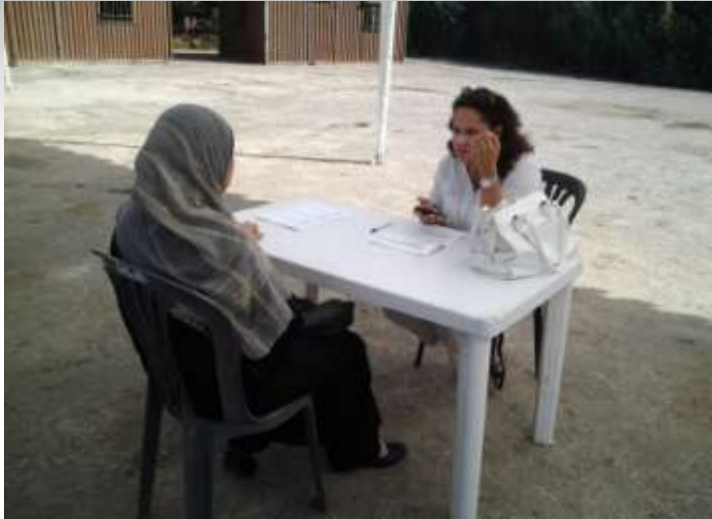
Profiling in the field